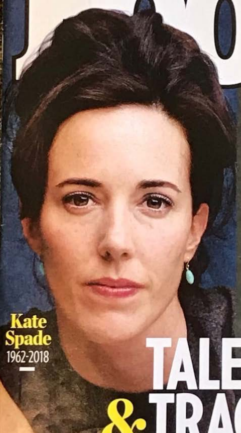
Kate Spade 1962-2018